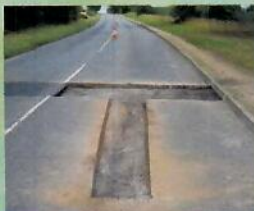
Preparation for Trench Restoration