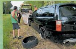
Pothole Wheel damage