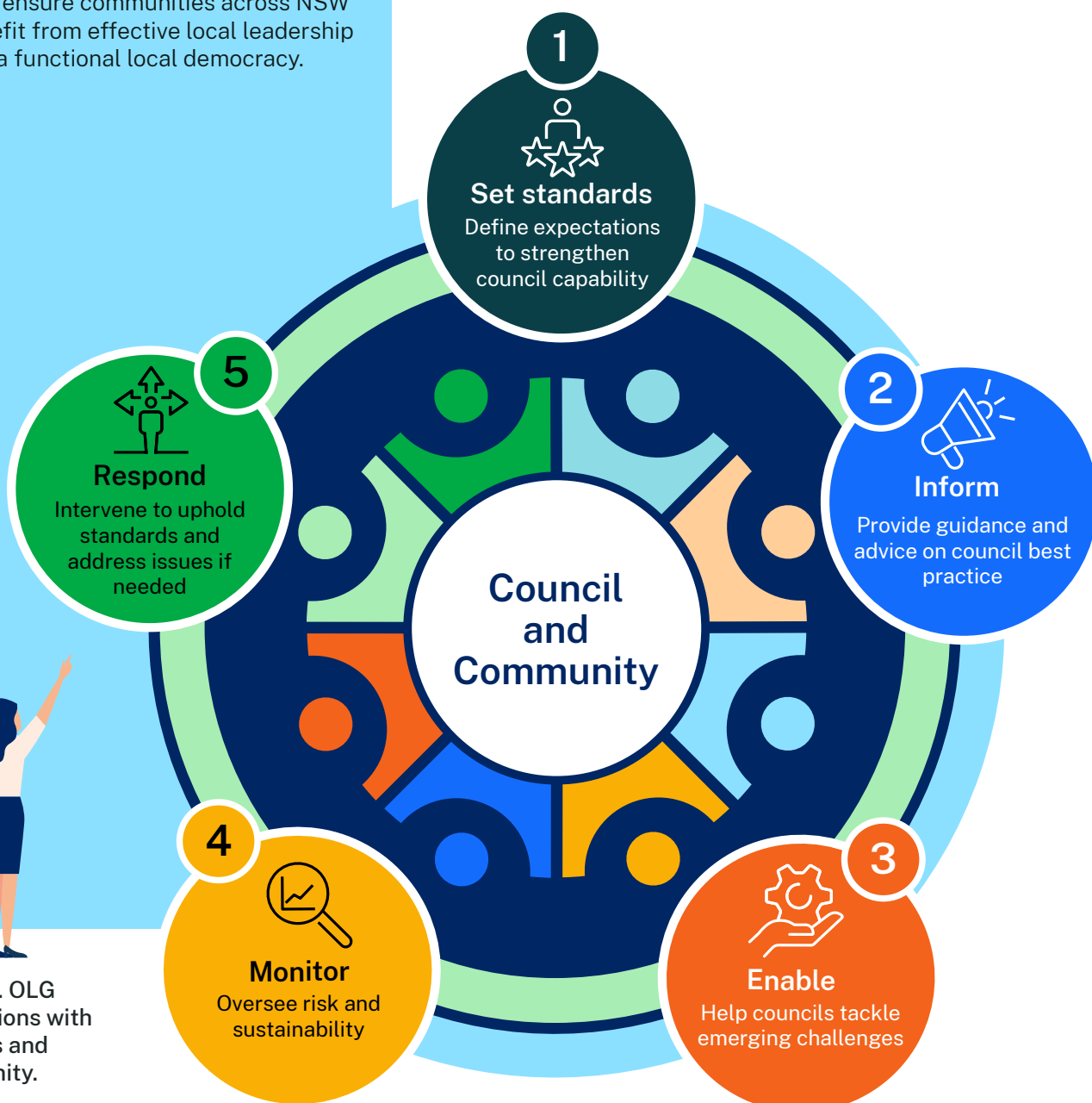
Figure 1. OLG interactions with councils and community.

We support and regulate local government through 5 key actions: